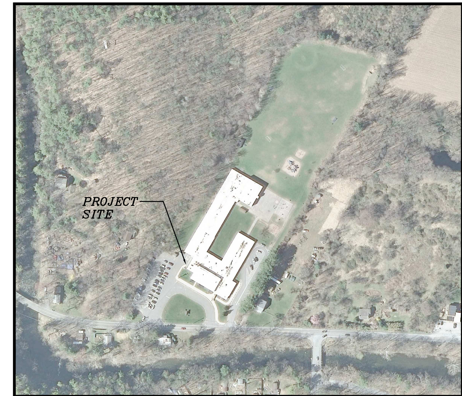
NORTH AERIAL VICINITY MAP SCALE: 1" = 200' SOURCE: NEW YORK STATE ORTHOMAGRY, PHOTO DATE SPRING 2013